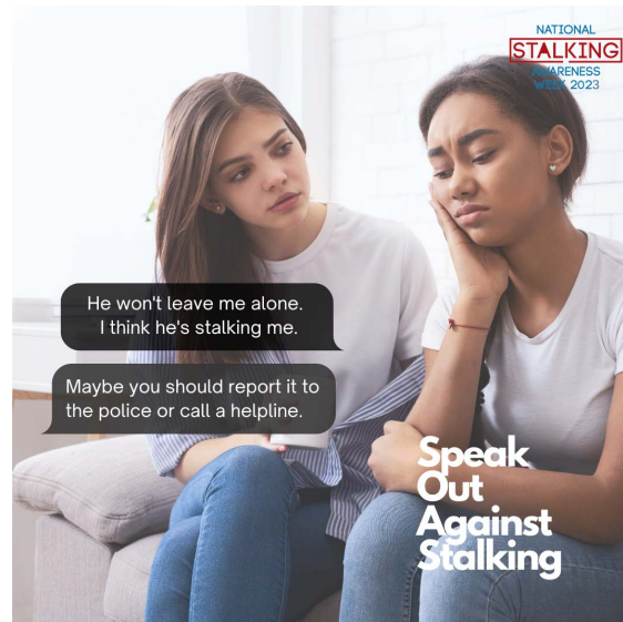
NSAW 23 Social Image 3

www.actionagainststalking.org/youngpeople