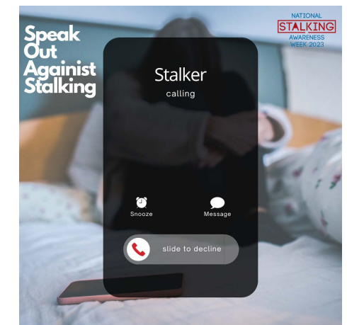
NSAW 23 Social Image 2