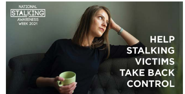
NSAW 21 Social Image 1