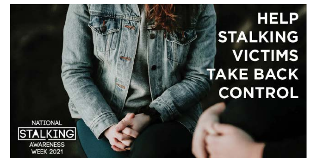
NSAW 21 Social Image 2