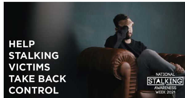
NSAW 21 Social Image 3